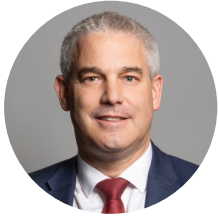
Steve Barclay MP, 2019

No one in this House cares more about the issue of live exports than I do and I am determined that the Government will deliver on that manifesto commitment.