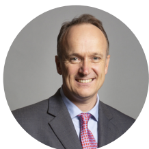
Dr Neil Hudson MP

It is welcome that the Government will introduce a Bill about animal welfare and live exports. With the freedoms produced by Brexit, it is time to outlaw long and unnecessary journeys simply for fattening and slaughter.