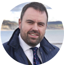
Chris Loder MP, 2022

It is impossible to ban cruel live animal exports while we remain in the EU. We're working to #GetBrexitDone so we can get on with the job of protecting animal welfare once we leave the EU.