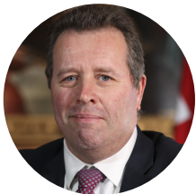
Mark Spencer MP, 2023

...My hon. Friend Craig Mackinlay...referred to Kent Action Against Live Exports, which deserves a huge tribute for all the work that it has done. That group has shone a light on the most disgraceful conditions that our animals have been forced to endure, having to travel hours and hours all the way down to southern Europe. That is not acceptable.