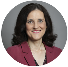
Theresa Villiers MP, 2023

No one in this House cares more about the issue of live exports than I do and I am determined that the Government will deliver on that manifesto commitment.