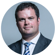
Kevin Foster MP

We remain committed to ending the export of live animals for fattening and slaughter. There have not been any live exports for fattening or slaughter since 2020 and we want to make this permanent.